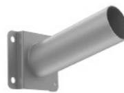
Wall / Top mounted adaptor