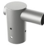
Pole top spigot adaptor